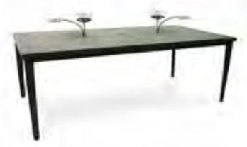
Rectangle Dining Table with orbits 14126 44"W x 86"L x 29.5"H