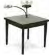
End Table with orbit 14127 23"W x 23"D x 21"H