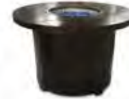
Firepit 14117 31"W x 29 1/2"D x 35 1/2"H