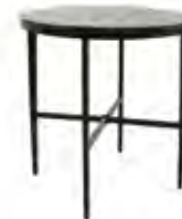
Pub Table 14145 43" Diameter x 42"H