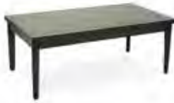
Coffee Table 14136 46"L x 25"D x 17 1/5"H